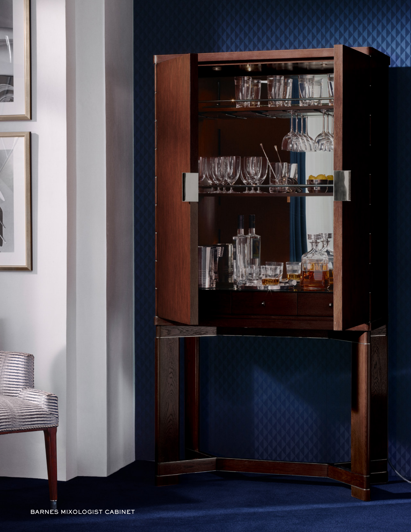
BARNES MIXOLOGIST CABINET