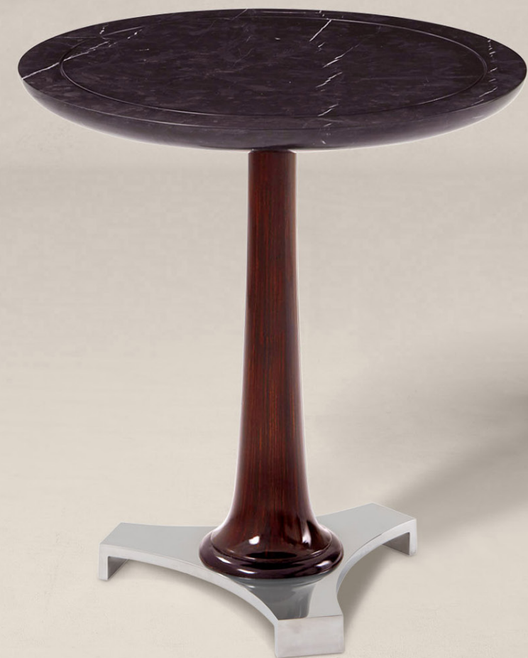
PARKER SIDE TABLE RL NUMBER: RL50008; RL50011 | LINK TO DETAILS W20" x D20" x H22" | METRIC: W51 x D51 x H56 CM