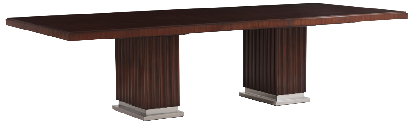
DUKE PEDESTAL DINING TABLE RL NUMBER: 1866-20 | LINK TO DETAILS W119.75" x D51.5" x H30" | METRIC: W304 x D131 x H76 CM