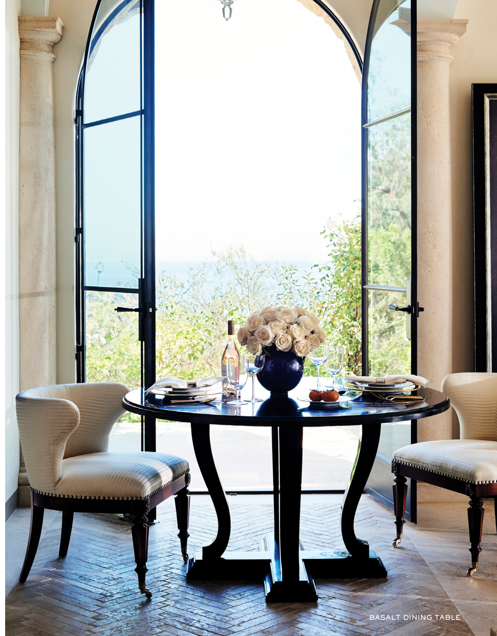
BASALT DINING TABLE