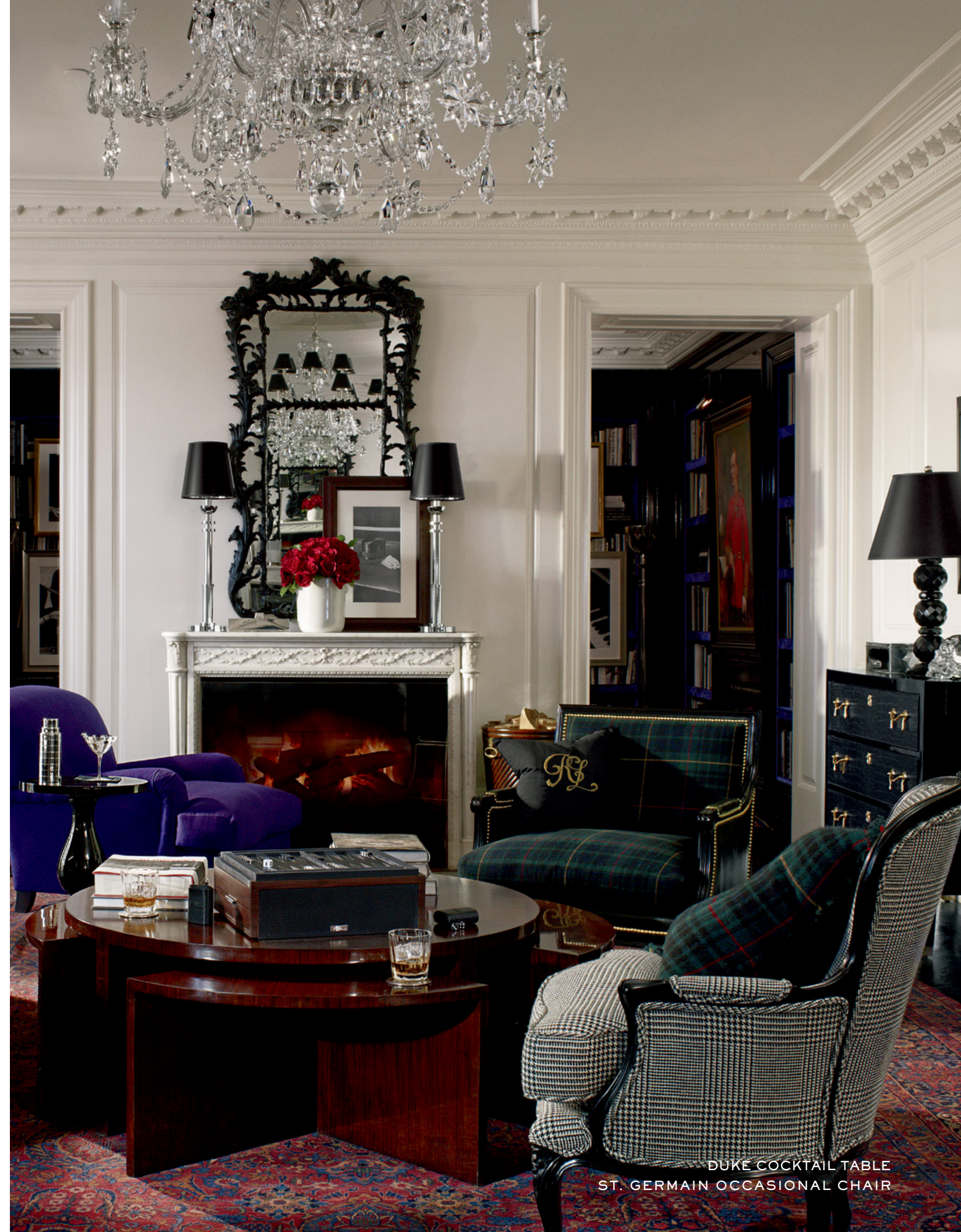
DUKE COCKTAIL TABLE ST. GERMAIN OCCASIONAL CHAIR