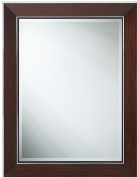
PRYCE MIRROR RL NUMBER: WALL: RL31001; FLOOR: | LINK TO DETAILS WALL: W42" x D3" x H54"; FLOOR: W48" x D3.5" x H84" METRIC: WALL: W107 x D7 x H137 CM; FLOOR: W122 x D9 x H213 CM