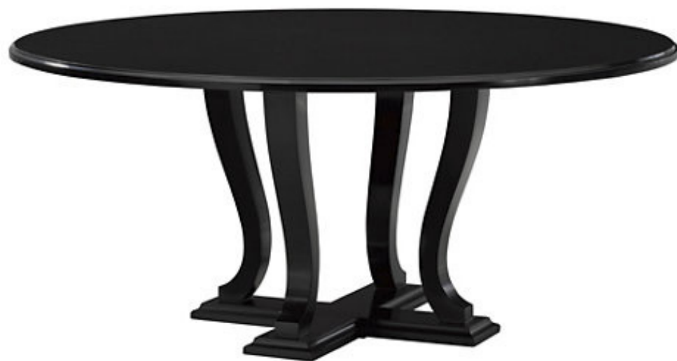
BASALT DINING TABLE RL NUMBER: 39543-20 | LINK TO DETAILS W68" x D68" x H29.75" | METRIC: W173 x D173 x H76 CM