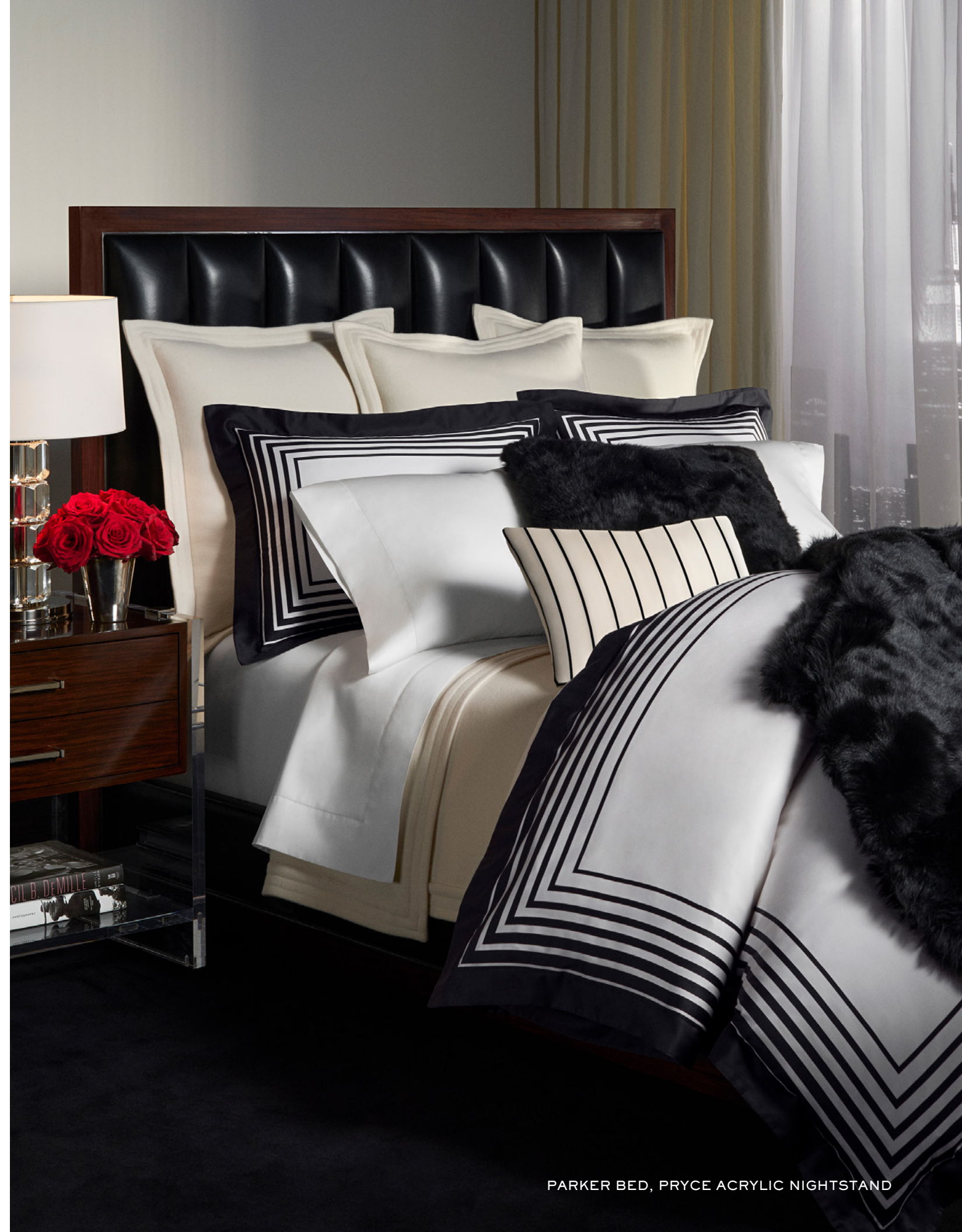
PARKER BED, PRYCE ACRYLIC NIGHTSTAND

RL NUMBER: RL50002 | LINK TO DETAILS W32" x D21" x H28" | METRIC: W81 x D53 x H71 CM