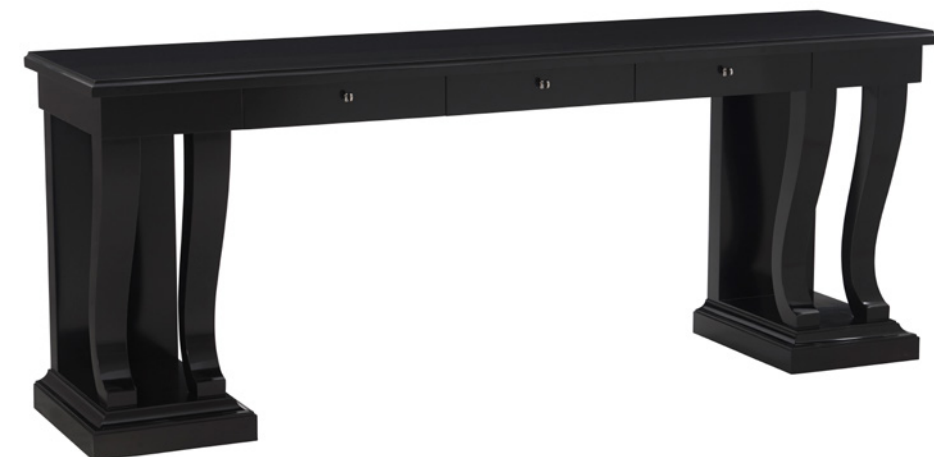
BASALT CONSOLE RL NUMBER: 39543-44 | LINK TO DETAILS W89.5" x D22.25" x H35" | METRIC: W227 x D57 x H89 CM