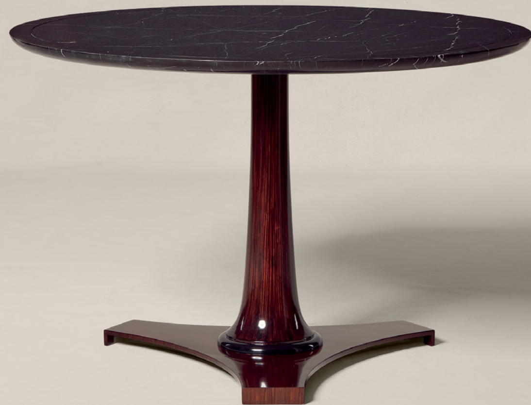
PARKER HALL TABLE RL NUMBER: RL55001 | LINK TO DETAILS W48" x D48" x H31" | METRIC: W122 x D122 x H79 CM