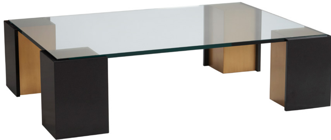
GARRON COCKTAIL TABLE RL NUMBER: 39541-40 | LINK TO DETAILS W55.5" x D39.5" x H14.25" | METRIC: W141 x D100 x H36 CM