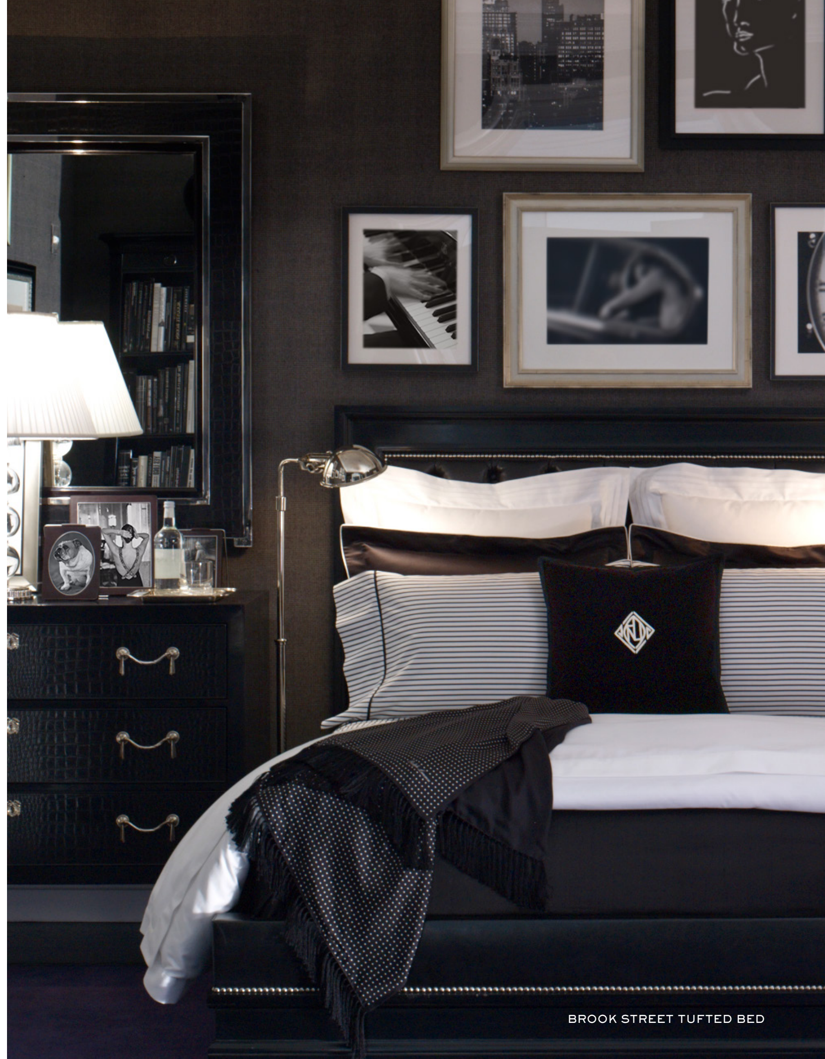
BROOK STREET TUFTED BED

RL NUMBER: 7620-06 | LINK TO DETAILS W31" x D20" x H29" | METRIC: W79 x D51 x H74 CM