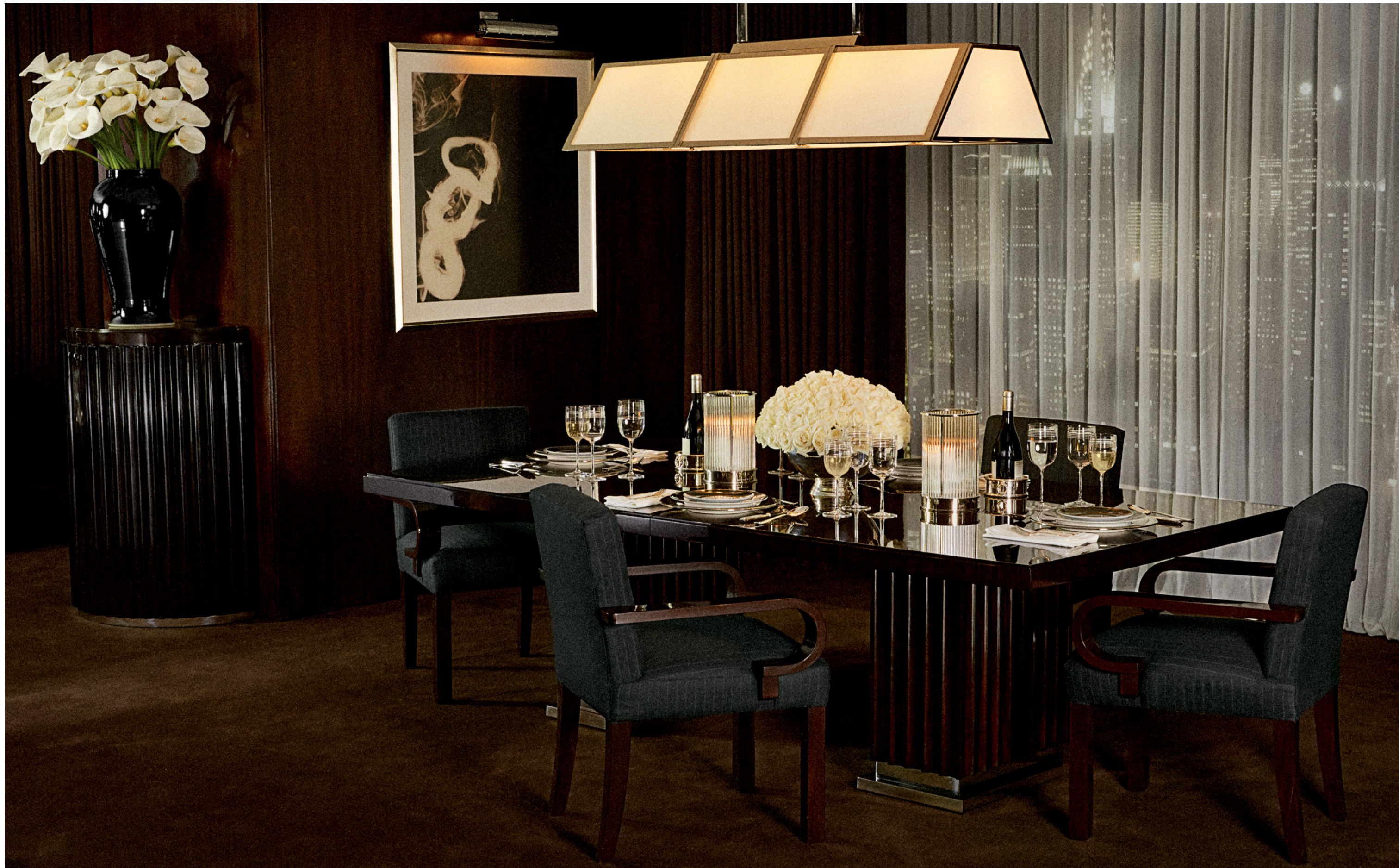
DUKE PEDESTAL DINING TABLE