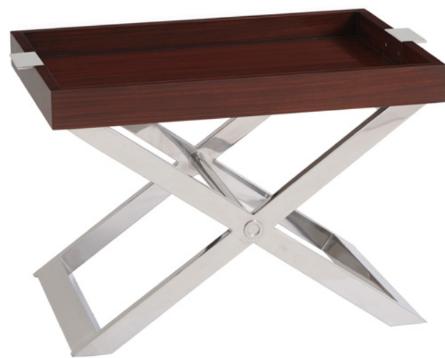
PIERCE TRAY TABLE RL NUMBER: 1868-40 | LINK TO DETAILS W28" x D18" x H18" | METRIC: W71 x D46 x H46 CM