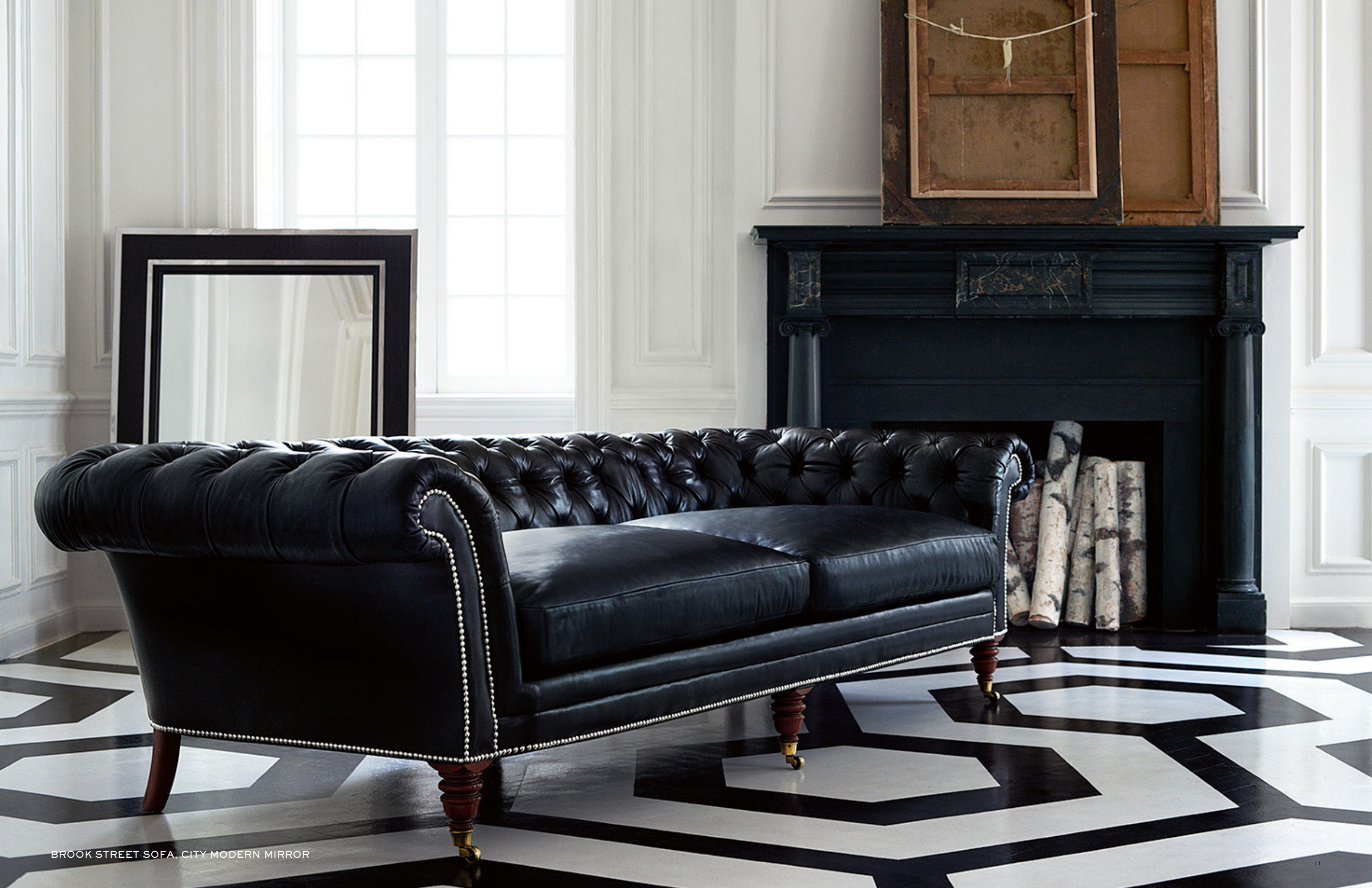
BROOK STREET SOFA, CITY MODERN MIRROR