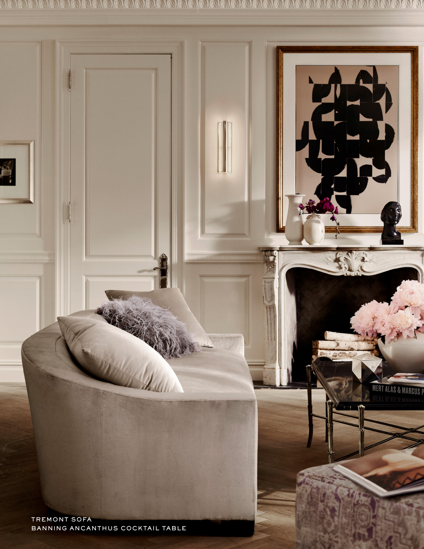
TREMONT SOFA BANNING ANCANTHUS COCKTAIL TABLE