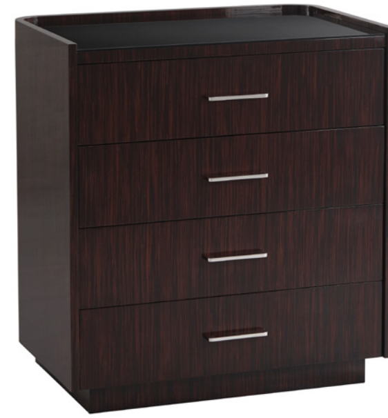
MODERN METROPOLIS BEDSIDE CHEST RL NUMBER: 1605-06 | LINK TO DETAILS W30" x D19" x H32.5" | METRIC: W76 x D48 x H83 CM