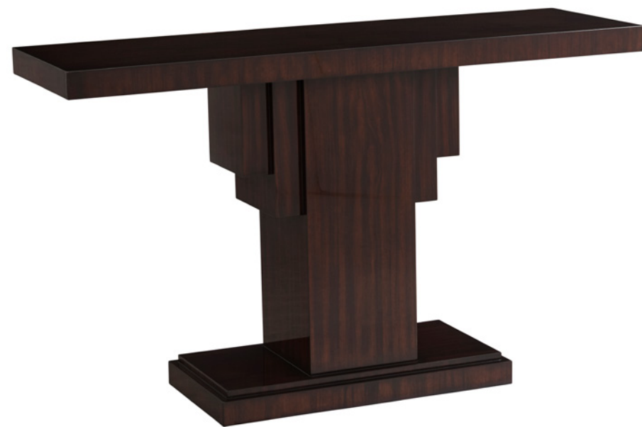
PENTHOUSE SUITE PEDESTAL CONSOLE RL NUMBER: 35001-44 | LINK TO DETAILS W57" x D17.75" x H34" | METRIC: W145 x D45 x H86 CM