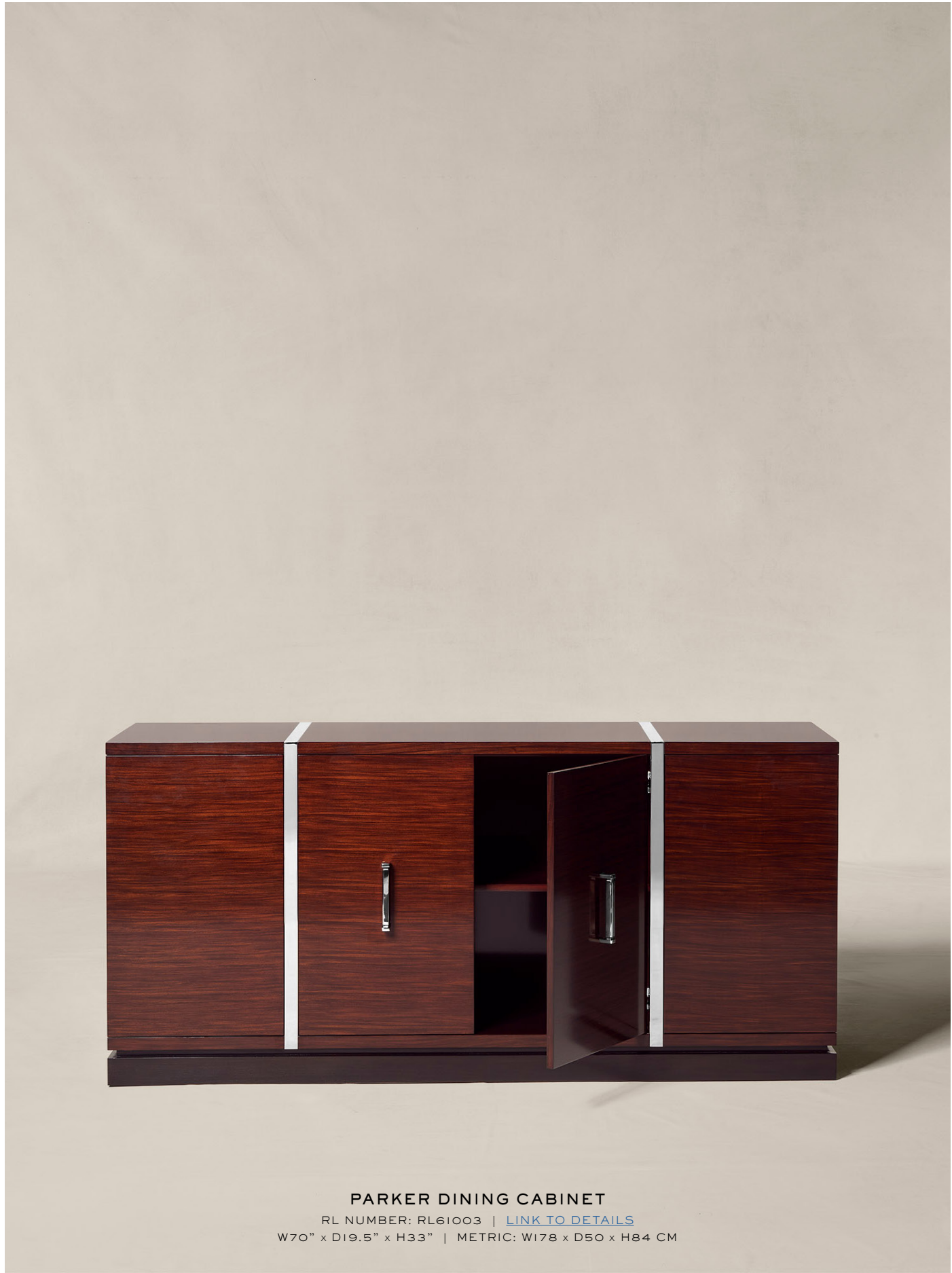
PARKER DINING CABINET RL NUMBER: RL61003 | LINK TO DETAILS W70" x D19.5" x H33" | METRIC: W178 x D50 x H84 CM