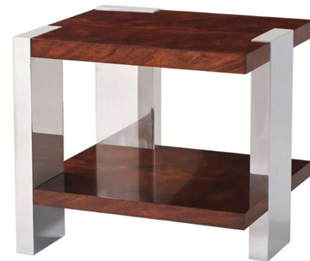
ALDRICH END TABLE RL NUMBER: 39503-42 | LINK TO DETAILS W26.5" x D22.5" x H24" | METRIC: W67 x D57 x H61 CM