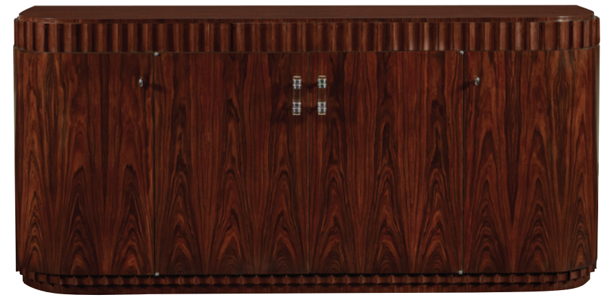
ART DECO DINING CABINET RL NUMBER: 1866-21 | LINK TO DETAILS W74.25" x D20" x H35" | METRIC: W189 x D51 x H89 CM