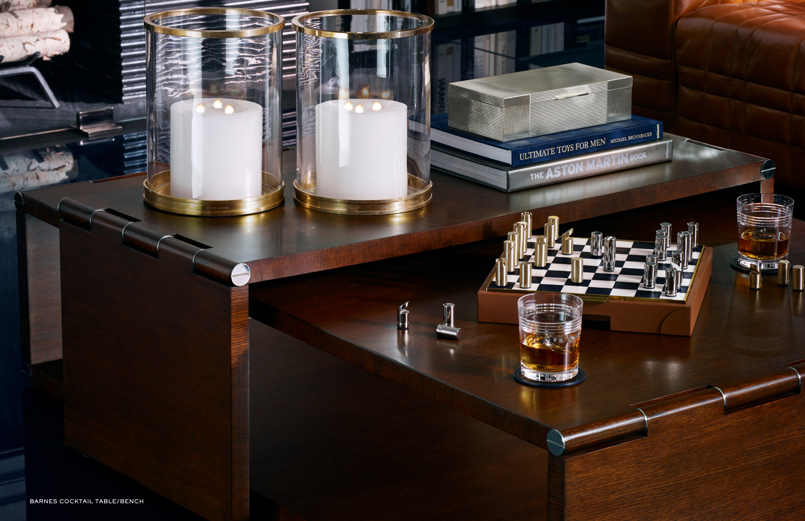
BARNES COCKTAIL TABLE/BENCH