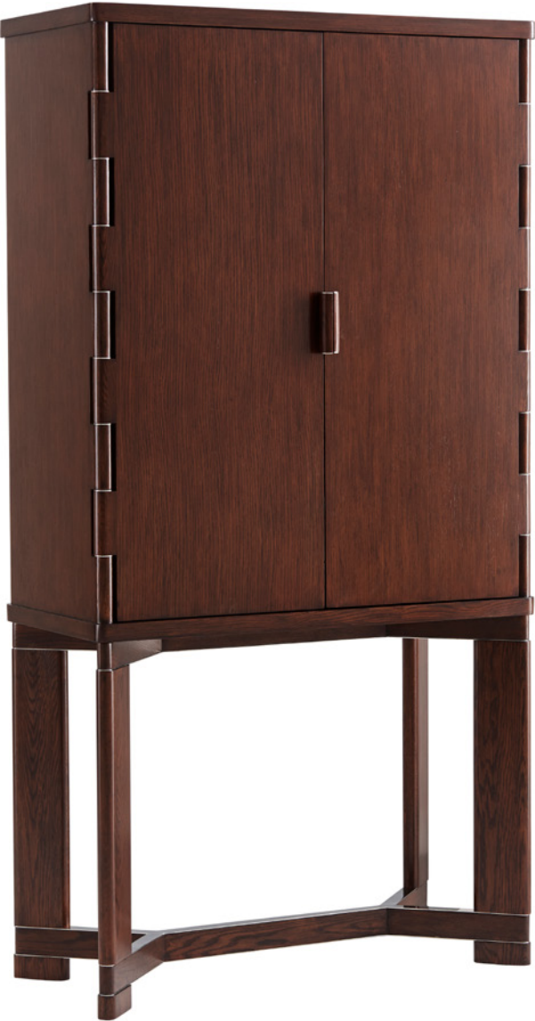
BARNES MIXOLOGIST CABINET RL NUMBER: 39523-25 | LINK TO DETAILS W41" x D19" x H80" | METRIC: W104 x D48 x H203 CM