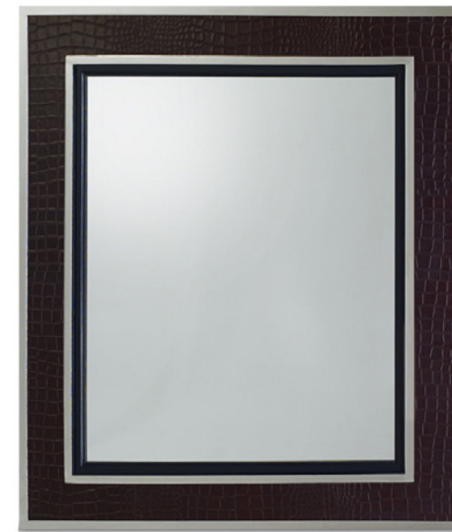
CITY MODERN MIRROR RL NUMBER: 7000-04 | LINK TO DETAILS W43" x D2.25" x H50" | METRIC: W109 x D6 x H127 CM