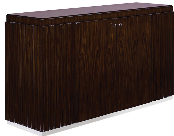
PENTHOUSE SUITE FLUTED CONSOLE RL NUMBER: 35010-44 | LINK TO DETAILS W64.5" x D18.75" x H36" | METRIC: W164 x D48 x H91 CM