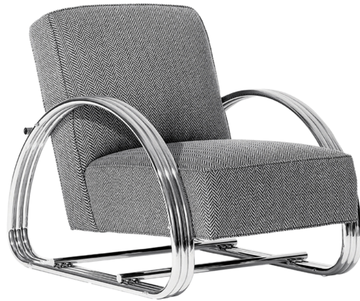
HUDSON ST. LOUNGE CHAIR RL NUMBER: 424-03 | LINK TO DETAILS W30" x D37" x H35" | METRIC: W76 x D94 x H89 CM