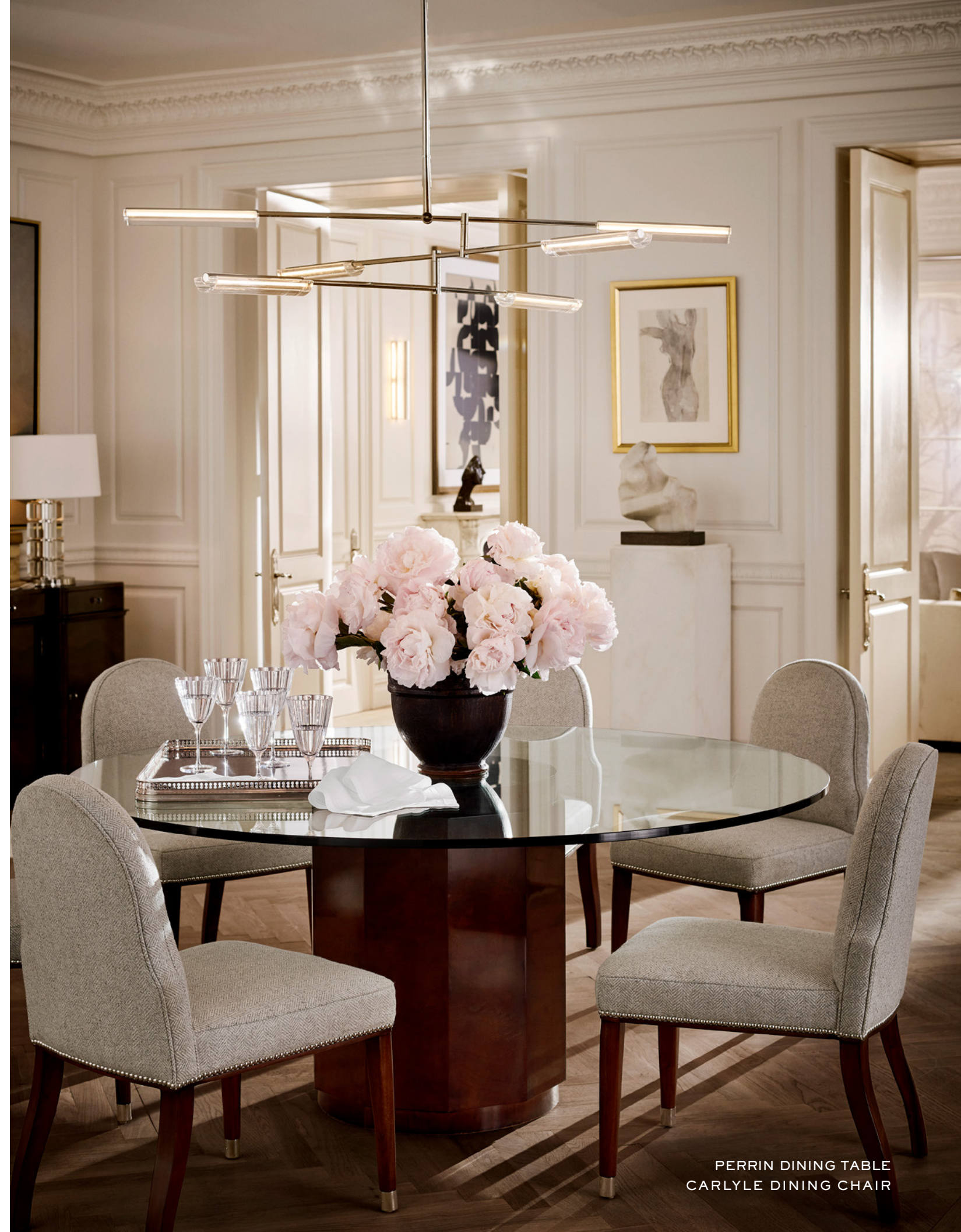
PERRIN DINING TABLE CARLYLE DINING CHAIR