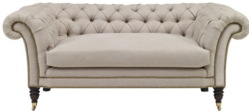
BROOK STREET LOVESEAT | BROOK STREET SOFA RL NUMBER: LOVESEAT: 751-02; SOFA: 751-05 | LINK TO DETAILS LOVESEAT: W74" x D45" x H36"; SOFA: W97" x D45" x H36" METRIC: LOVESEAT: W188 x D114 x H91 CM; SOFA: W246 x D114 x H91 CM