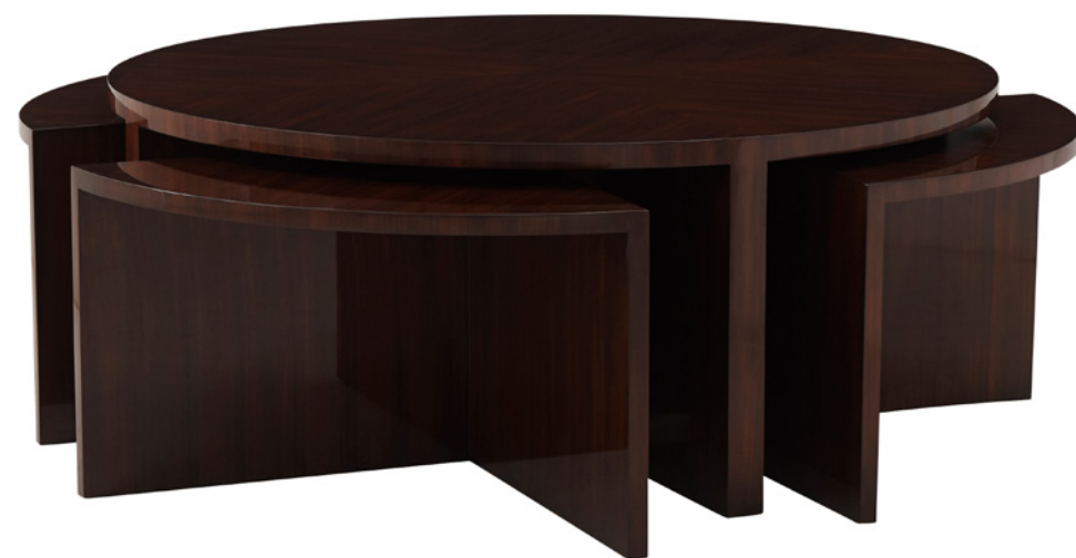
DUKE COCKTAIL TABLE RL NUMBER: 1866-40 | LINK TO DETAILS W46" x D46" x H18.5" | METRIC: W117 x D117 x H47 CM