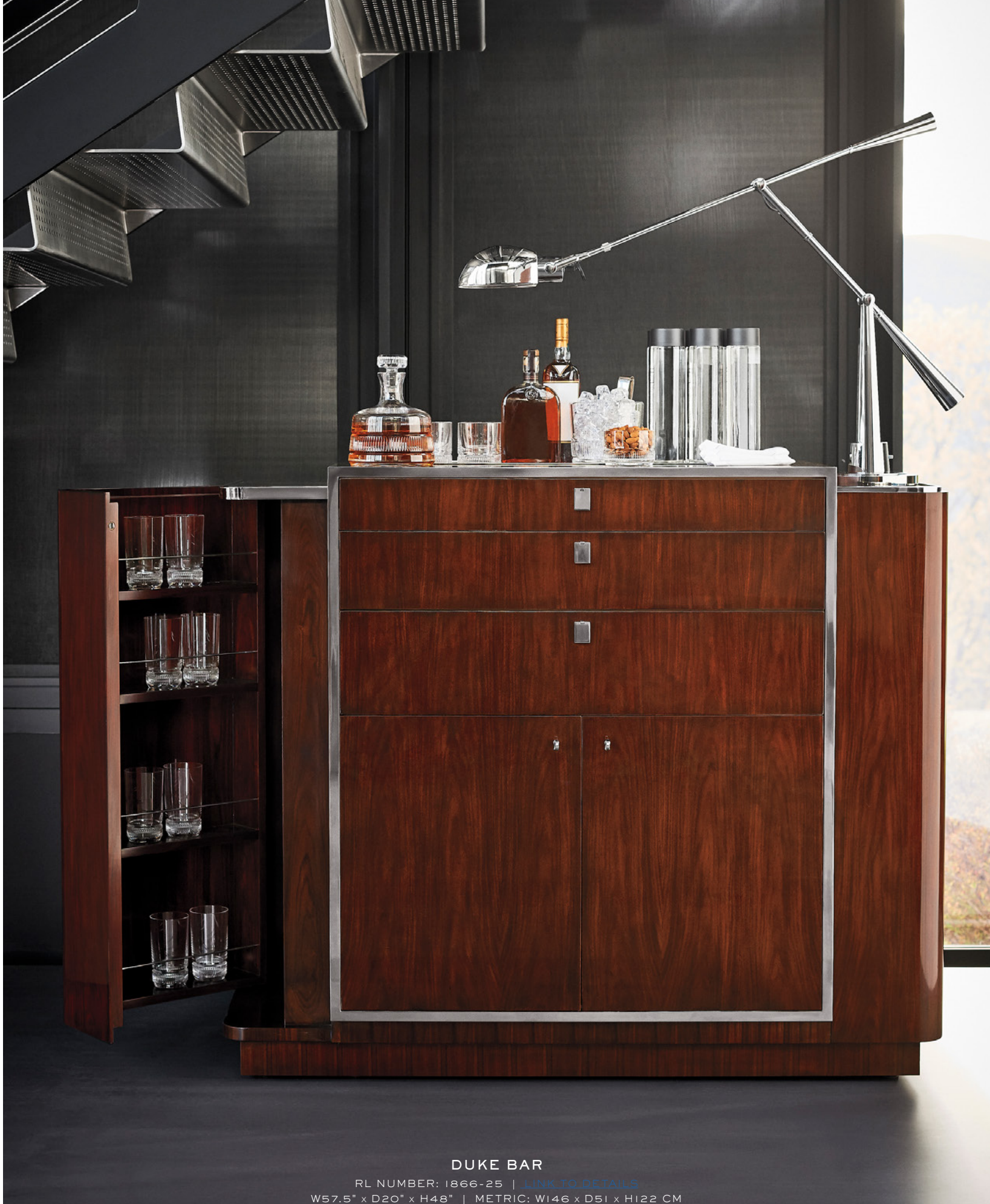
DUKE BAR RL NUMBER: 1866-25 | LINK TO DETAILS W57.5" x D20" x H48" | METRIC: W146 x D51 x H122 CM