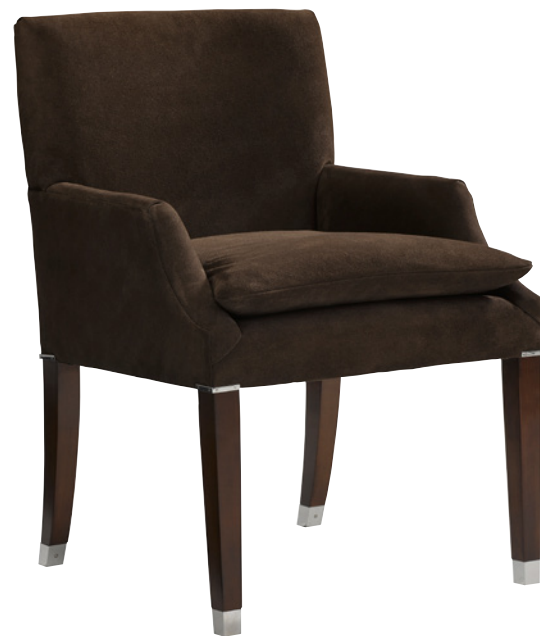
LAWSON UPHOLSTERED ARM CHAIR RL NUMBER: 39500-27 | LINK TO DETAILS W23.5" x D26" x H34" | METRIC: W60 x D66 x H86 CM