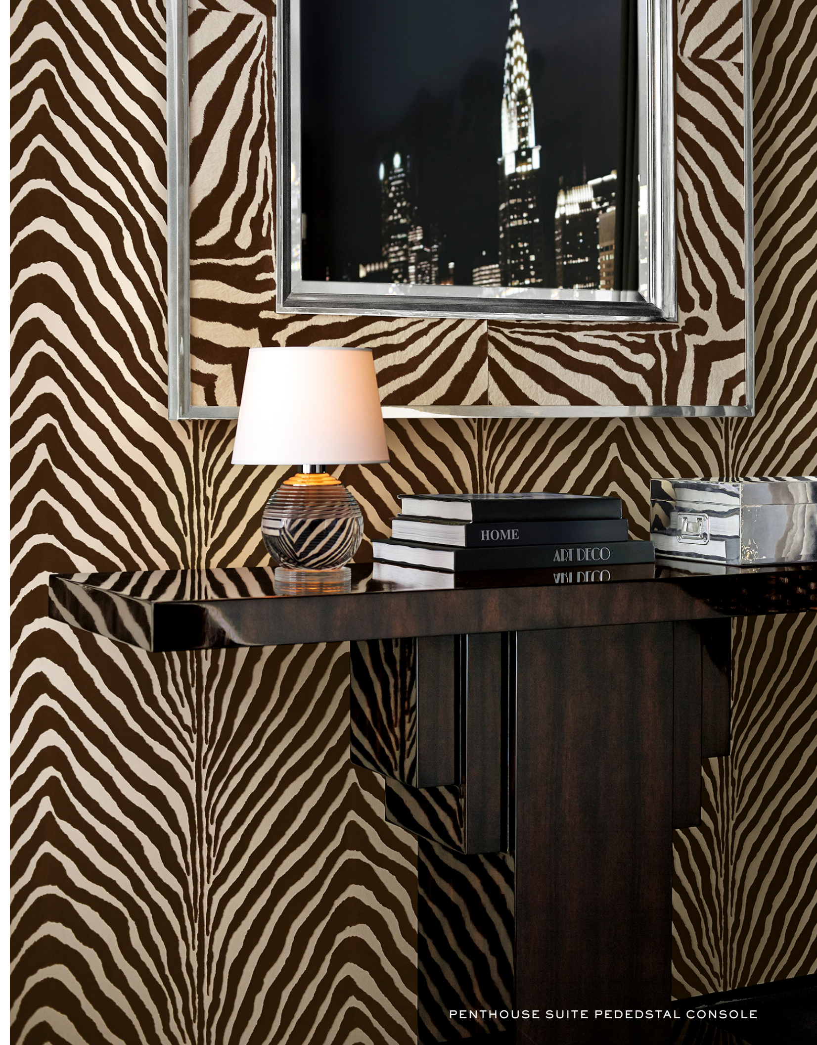
PENTHOUSE SUITE PEDEDSTAL CONSOLE