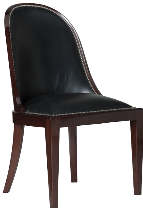
CUTLER DINING SIDE CHAIR

RL NUMBER: 868-27 | LINK TO DETAILS W22.25" x D24.5" x H37.5" | METRIC: W57 x D62 x H95 CM