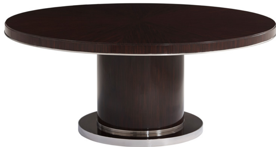
MODERN METROPOLIS DINING TABLE RL NUMBER: 1605-20 | LINK TO DETAILS W72" x D72" x H30" | METRIC: W183 x D183 x H76 CM