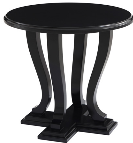
BASALT OCCASIONAL TABLE RL NUMBER: 39543-42 | LINK TO DETAILS W30" x D30" x H27.25" | METRIC: W76 x D76 x H69 CM