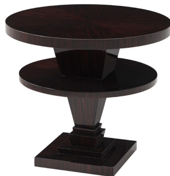
WHITCOMB END TABLE RL NUMBER: 39509-41 | LINK TO DETAILS W27.25" x D27.25" x H23.75" | METRIC: W70 x D70 x H61 CM