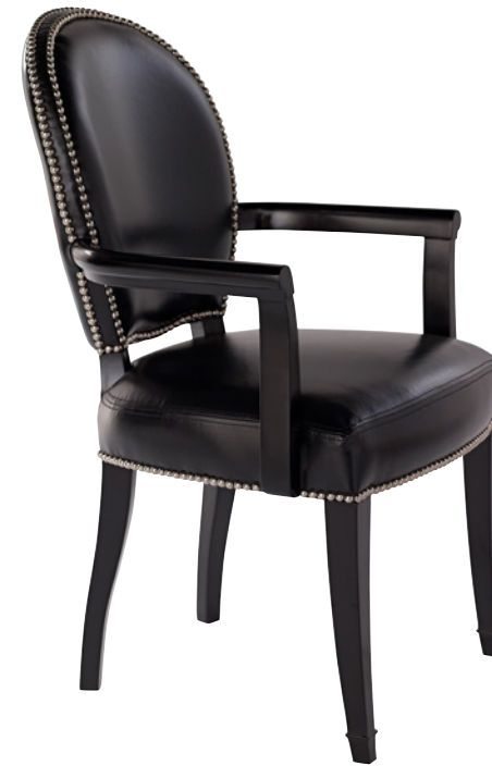
DUKE ARM CHAIR

RL NUMBER: 1807-28 | LINK TO DETAILS W23" x D22.75" x H32" | METRIC: W58 x D58 x H81 CM