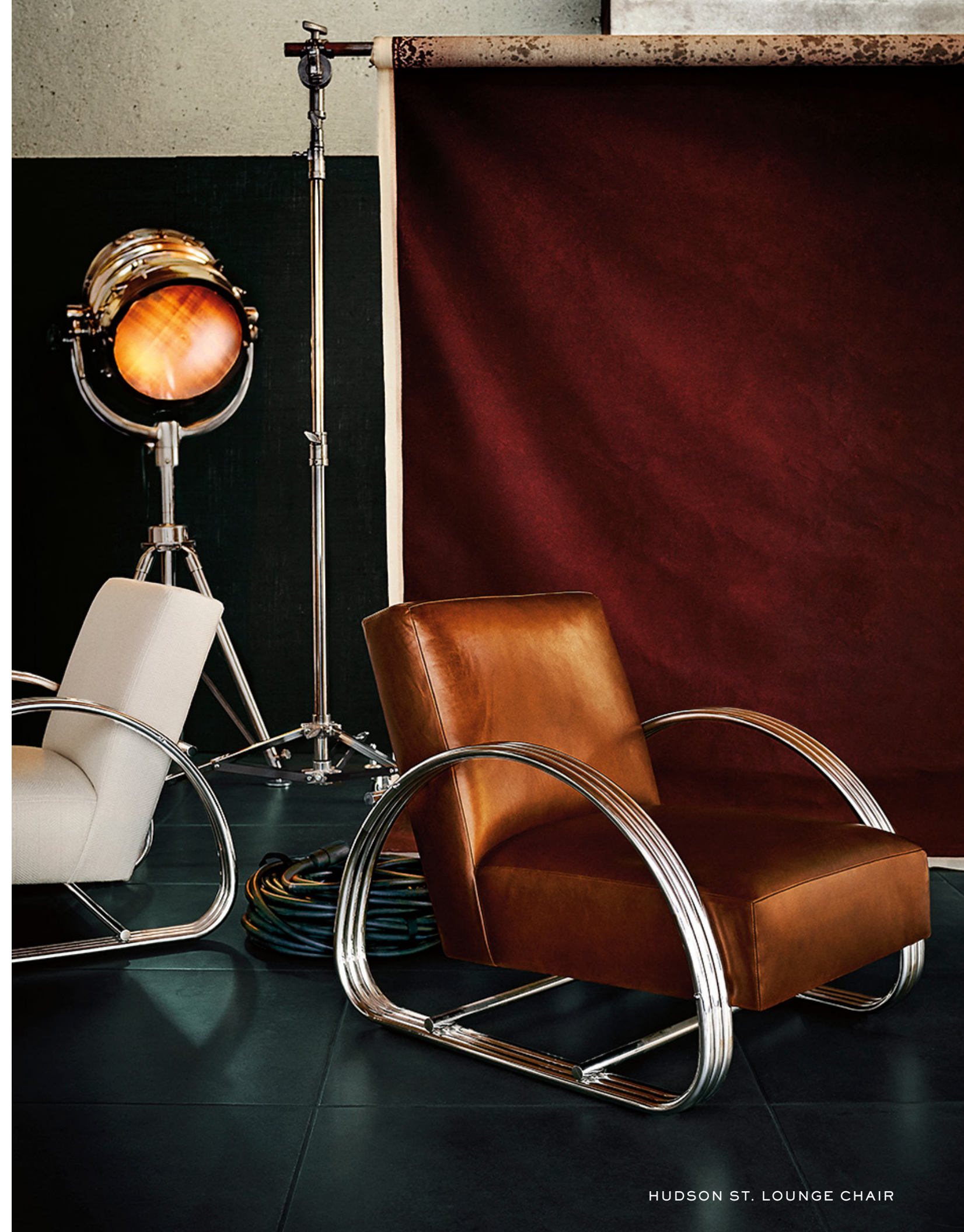
HUDSON ST. LOUNGE CHAIR