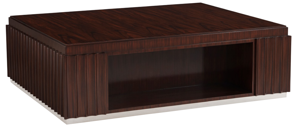
PENTHOUSE SUITE FLUTED COCKTAIL TABLE RL NUMBER: 35010-40 | LINK TO DETAILS W57" x D45.75" x H18" | METRIC: W145 x D116 x H46 CM