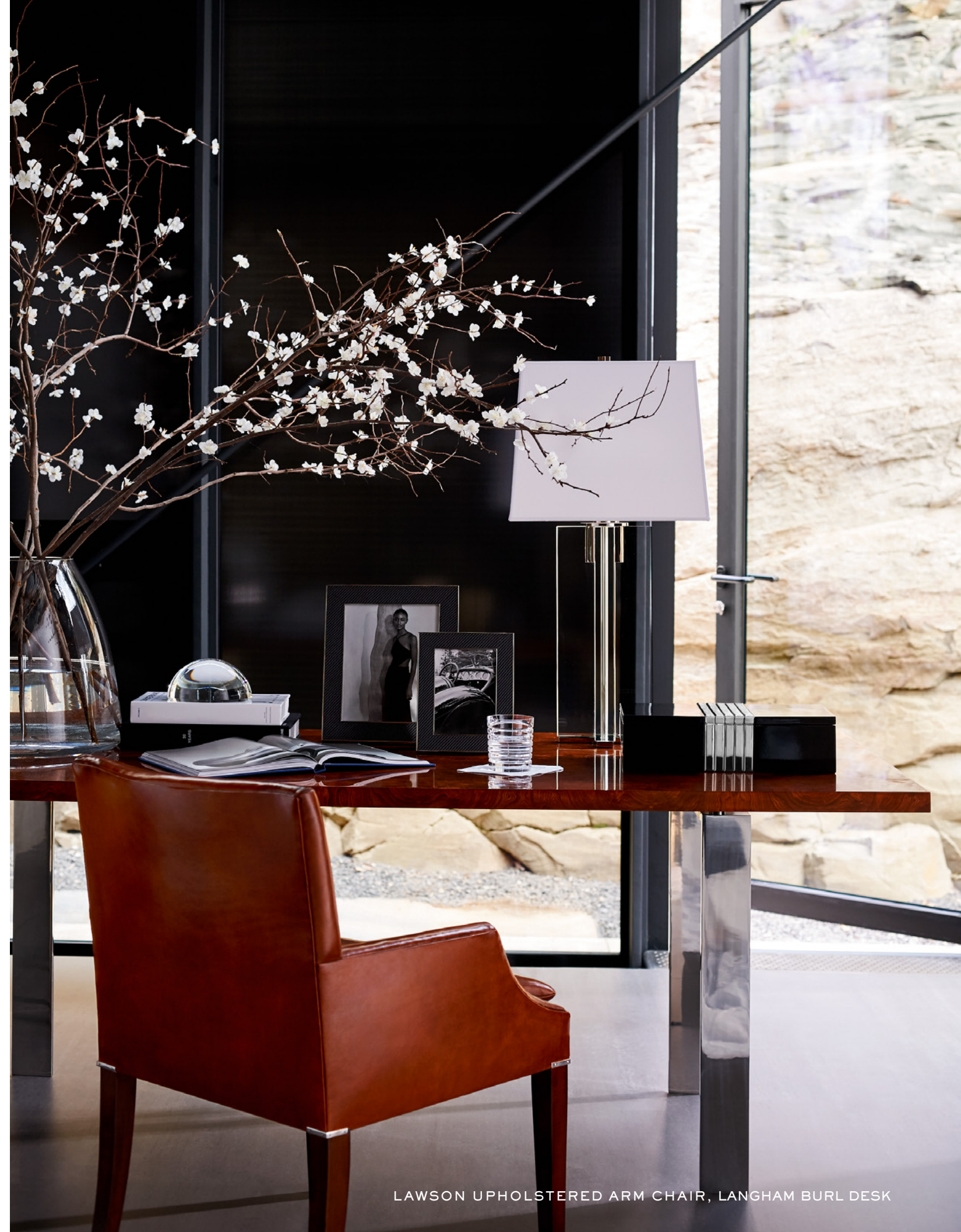
LAWSON UPHOLSTERED ARM CHAIR, LANGHAM BURL DESK