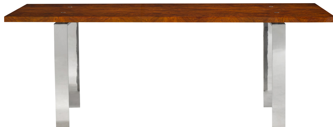
LANGHAM BURL DESK RL NUMBER: 39502-45 | LINK TO DETAILS W84" x D36" x H30" | METRIC: W213 x D92 x H76 CM