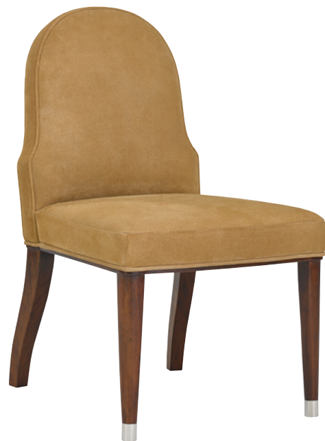
CARLYLE DINING CHAIR RL NUMBER: 762-28 | LINK TO DETAILS W21" x D26.5" x H36" | METRIC: W53 x D67 x H91 CM