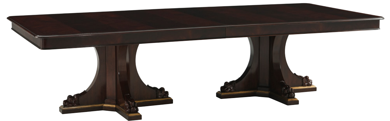
EMPIRE DOUBLE PEDESTAL TABLE

RL NUMBER: 39508-28 | LINK TO DETAILS W23" x D24.5" x H37" | METRIC: W58 x D62 x H94 CM