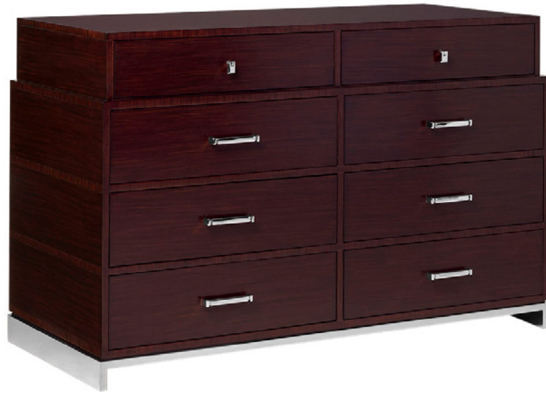
PRYCE BEDROOM CHEST RL NUMBER: RL60004 | LINK TO DETAILS W54" x D23" x H34" | METRIC: W137 x D58 x H86 CM