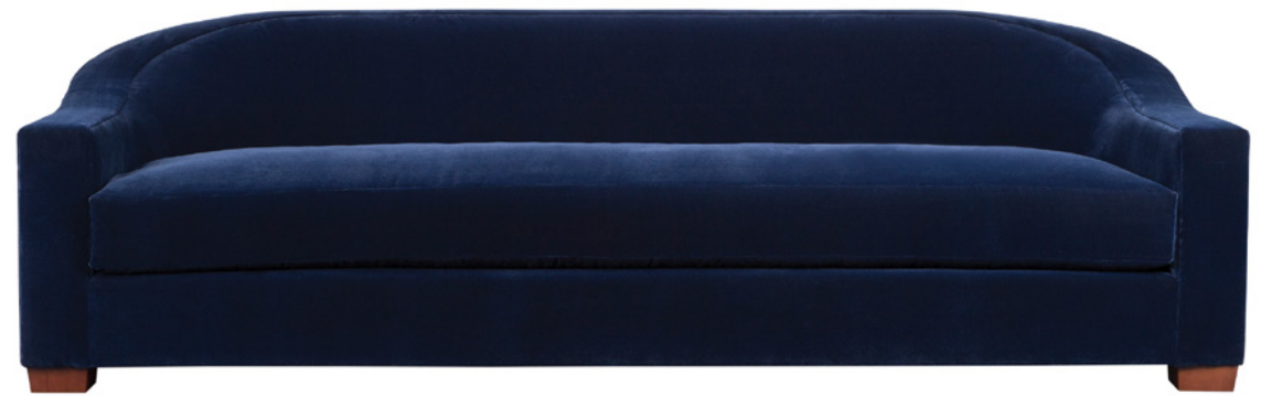
TREMONT SOFA RL NUMBER: 656-01 | LINK TO DETAILS W97" x D41" x H35" | METRIC: W246 x D104 x H89 CM