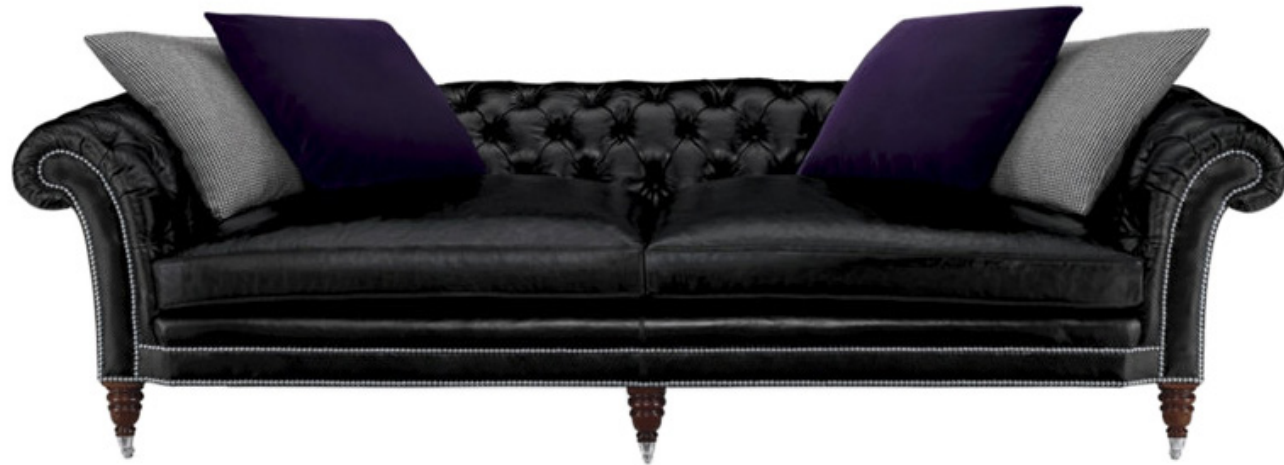
BROOK STREET TUFTED SOFA RL NUMBER: 751-01 | LINK TO DETAILS W110" x D45" x H36" | METRIC: W279 x D114 x H91 CM