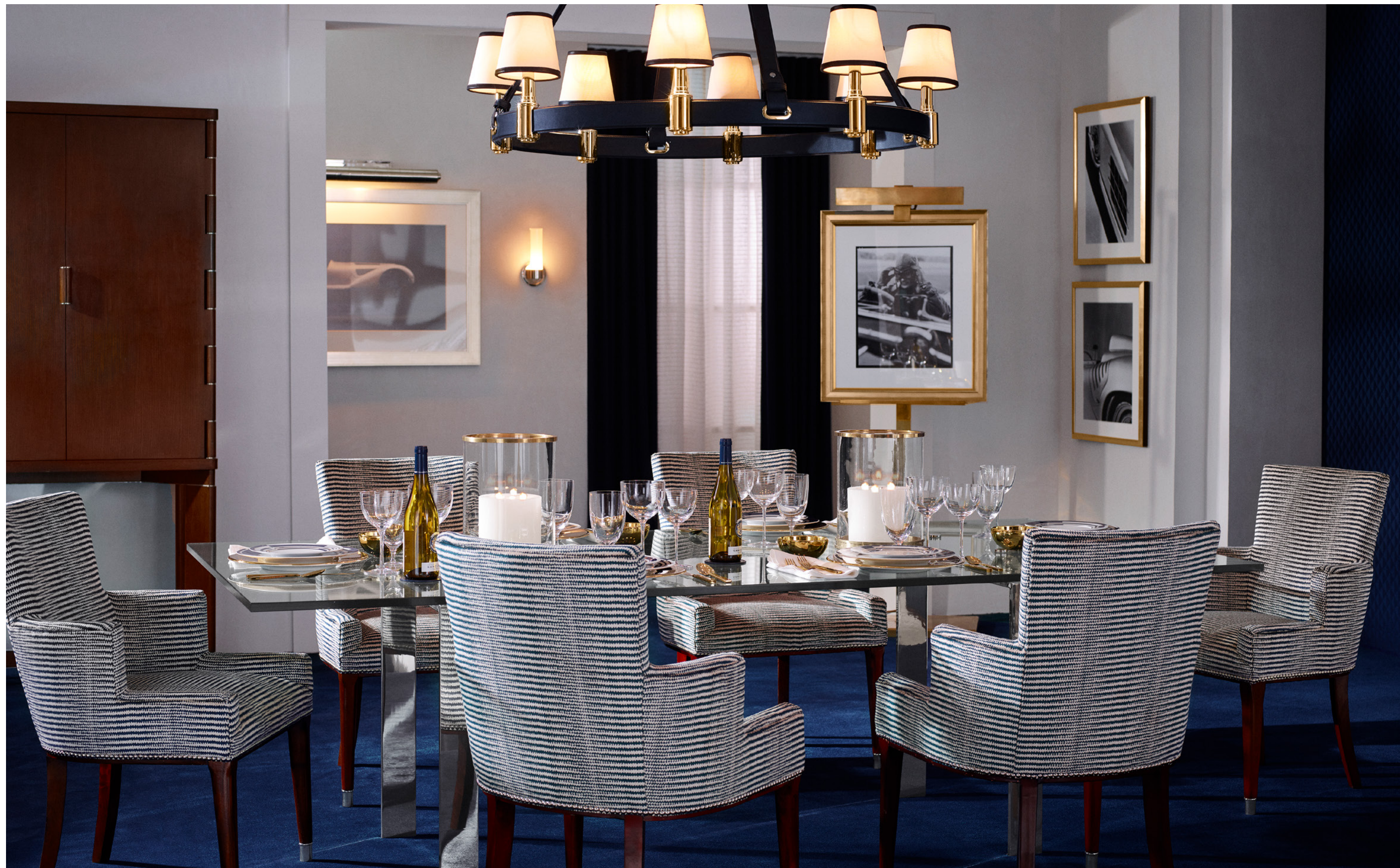
LANGHAM DINING TABLE BROOK STREET DINING SIDE CHAIR