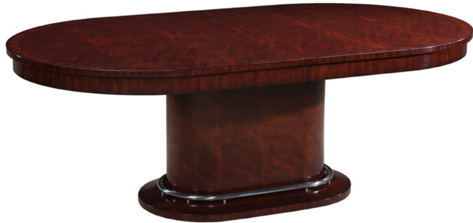
BROOK STREET DINING TABLE RL NUMBER: 7600-20 | LINK TO DETAILS W85" x D48" x H30" | METRIC: W216 x D122 x H76 CM