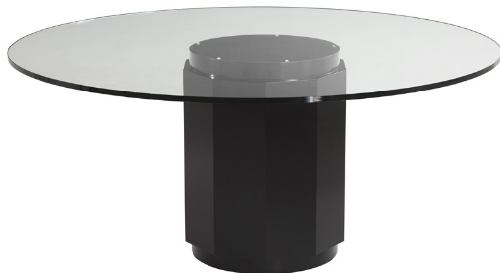
PERRIN DINING TABLE RL NUMBER: 39542-20 | LINK TO DETAILS W68" x D68" x H29.75" | METRIC: W173 x D173 x H76 CM