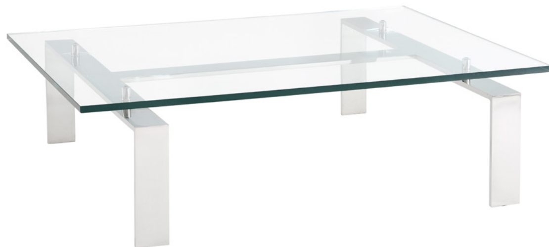
PALL MALL COCKTAIL TABLE RL NUMBER: 1865-40 | LINK TO DETAILS W54" x D44" x H15" | METRIC: W137 x D112 x H38 CM