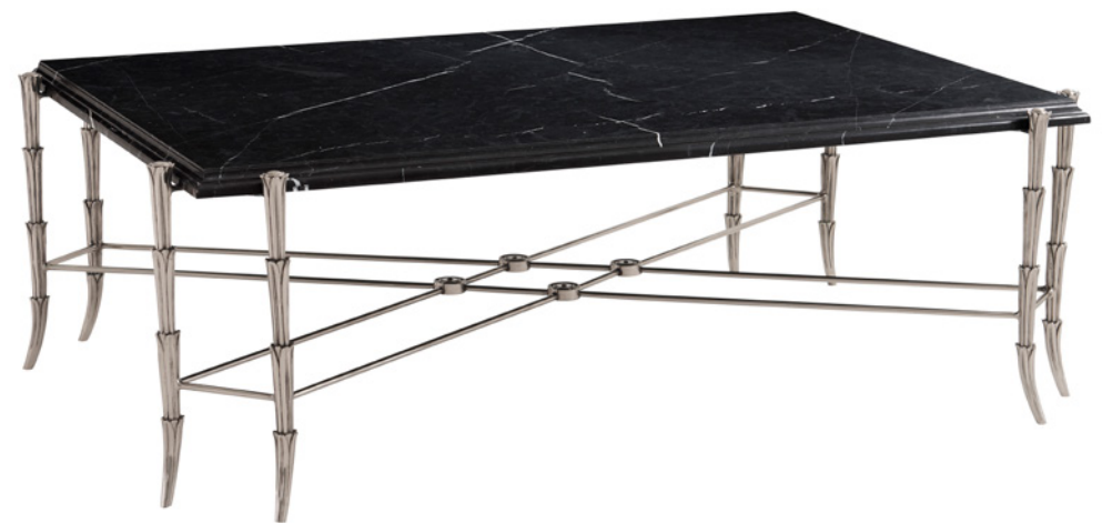
BANNING ANCANTHUS COCKTAIL TABLE RL NUMBER: 39538-40 | LINK TO DETAILS W56.5" x D40.5" x H18.5" | METRIC: W144 x D103 x H47 CM