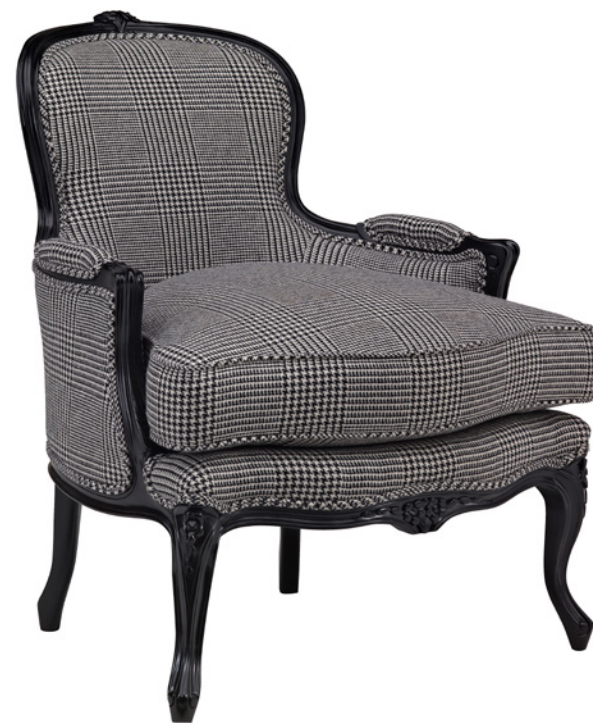
ST. GERMAIN OCCASIONAL CHAIR RL NUMBER: 895-03 | LINK TO DETAILS W28" x D29.5" x H36.5" | METRIC: W71 x D75 x H93 CM